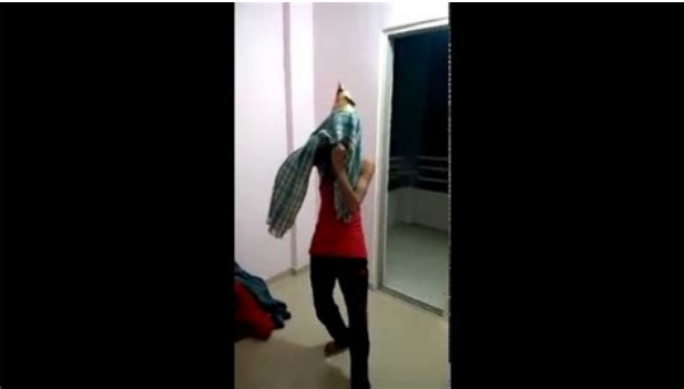
Afghan jalebi video song download bestwap.